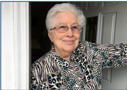
The Doors of Mercy are always open