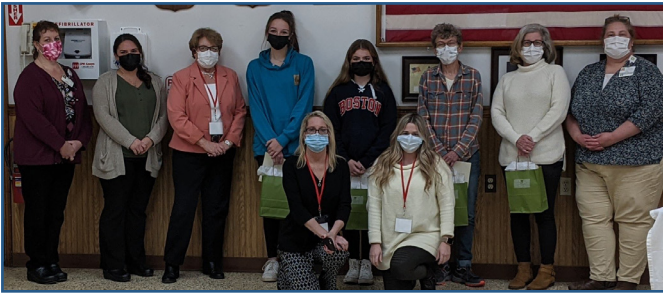
New Elizabethtown Community Hospital Community Friendship Volunteers trained in Moriah. November 2021

Mercy Care for the Adirondacks has received significant grant support from the Mother Cabrini Health Foundation, for which we are most grateful, to extend the model of its Age-friendly Communities Initiative to other communities in the Adirondacks and the North Country. The Mother Cabrini Health Foundation is making possible the dream for Mercy Care to assist more North Country older adults age in place more successfully by helping new communities to establish and operate their own Community Friendship Volunteer programs based on Mercy Care's model of informal social supports.