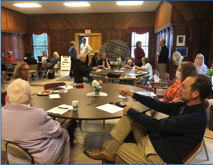
July 2021 Caregiving Working Group Meeting of Essex and Franklin Counties

Mercy Care hosted and facilitated meetings for the Caregiving Working Group on January 20, April 21, July 21, October 27, 2021 and January 19, 2022. Presenters included Director of the NY State Office for the Aging, Executive Director of Association on Aging in NY, NY Statewide Senior Action Council Executive Director introducing the proposed Master Plan for Aging included in Governor Hochul's State of the State address, New President and CEO of Adirondack Health, Essex County Director of Public Health on COVID-19 Healthcare Impacts, Caregiver COVID Impacts by Alzheimer's Disease Caregiver Support Initiative, SUNY Plattsburgh, and reports from the Directors of the Offices for the Aging in Essex and Franklin Counties.